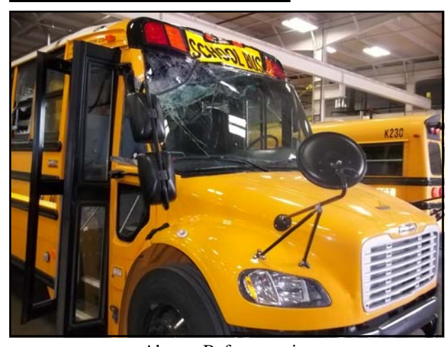
Above: Before repairs Below: During repairs

Here are some pictures from a 2013 Thomas C-2 school bus we recently repaired. A tree had fallen on top of the bus just after a student was dropped off!