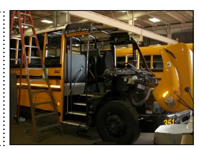
Above: During repairs Below: Final Product!

Here are some pictures from a 2013 Thomas C-2 school bus we recently repaired. A tree had fallen on top of the bus just after a student was dropped off!