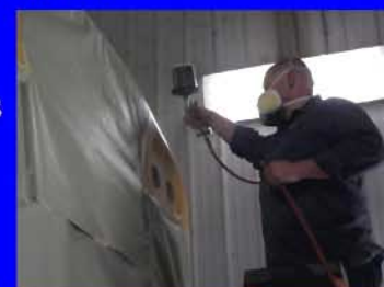
Spray painting a bus.