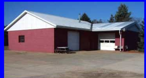
9360 East 14 ¼ Rd, Manton, MI 49663