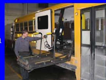
Repairing wheel chair lift on bus.